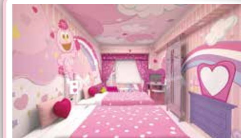
Moppy's Lucky Room

As long as curious Elmo is with us, we will be happy and energetic!