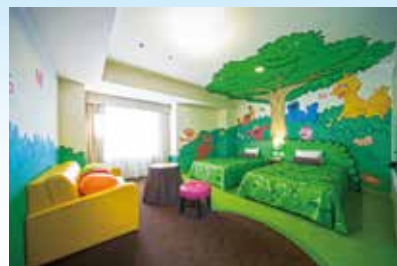
Sesame Street™ Big Forest Room

Walk along the fancy colorful corridor and happily head for the room.