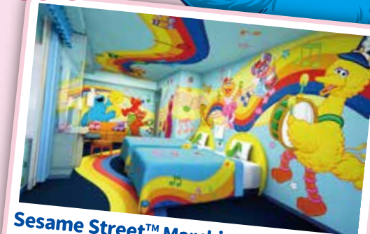
Sesame Street™ Marching Band Room

Enjoy a party with pajama-clad Elmo and his friends that can only be seen here.