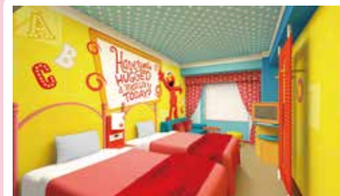
Elmo's Happy Room

Have a blast alongside Elmo and his friends as they play some fun melodies.