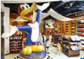
Universal Studios Store