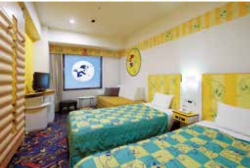
Woody Woodpecker Room

Universal Studios Japan's star, Woody Woodpecker and his jolly friends will welcome you.