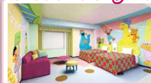
Sesame Street™ Pajama Party Fun Room

Enjoy a party with pajama-clad Elmo and his friends that can only be seen here.