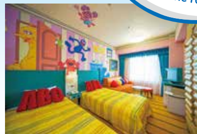
Sesame Street™ Happy Play Room

Sesame Street™ friends are playing hide-and-seek! Let's find them!