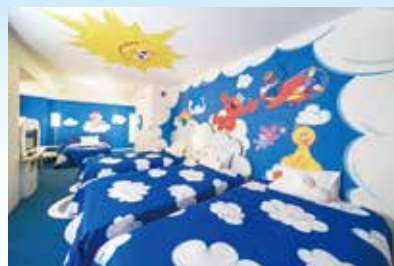
Sesame Street™ Sky View Room

Let's play on a fluffy cloud with Sesame Street™ friends.