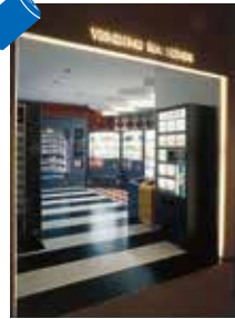
Vending machine corner